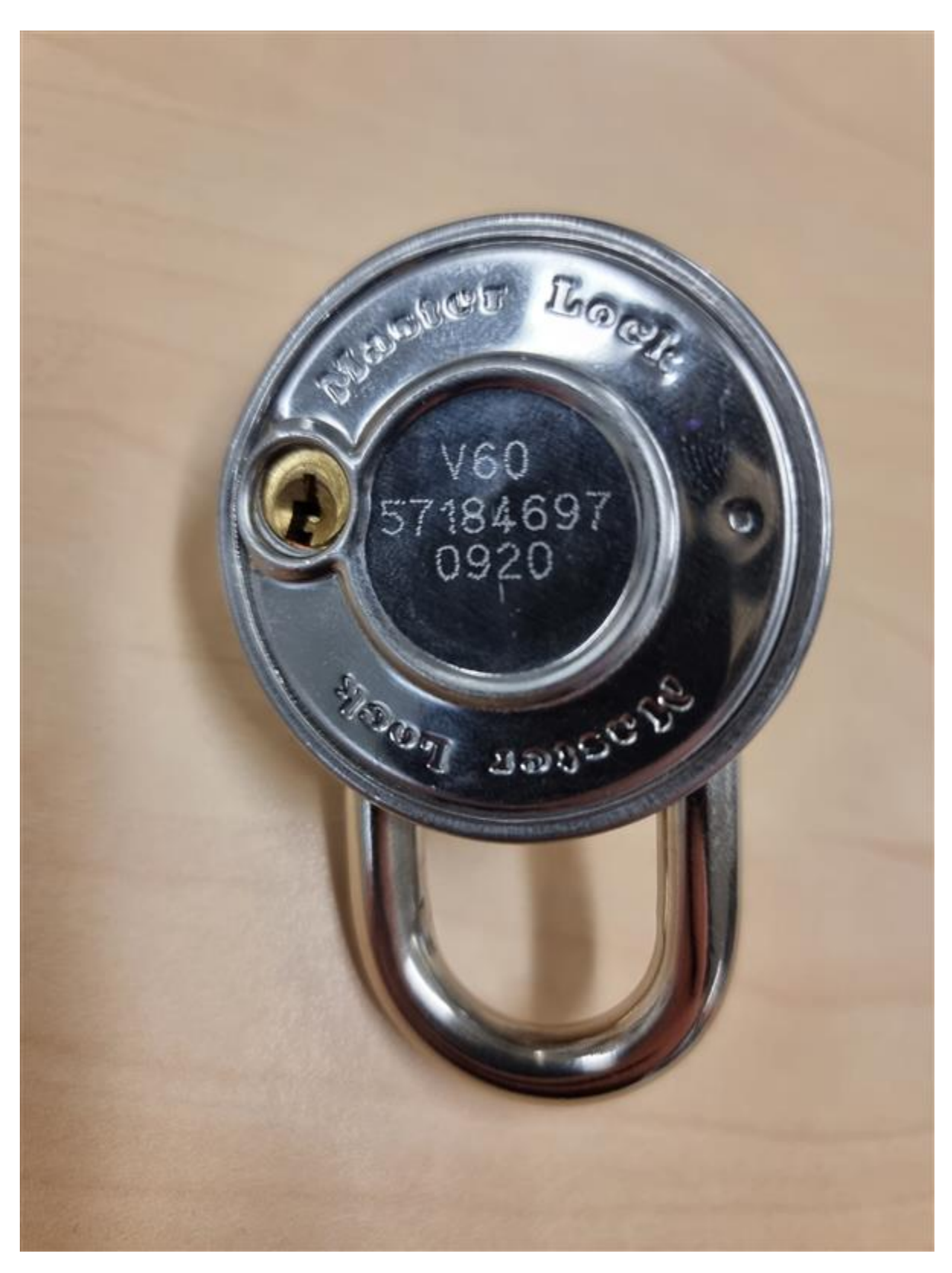
This lock's serial, for example, is 57184697. Don't worry about the other numbers/letters.

In Oliver, returning the padlock will bring up who the lock was borrowed out to in Oliver, as well as the combination. Open the Circulation Desk in Oliver, and make sure Returns is selected.